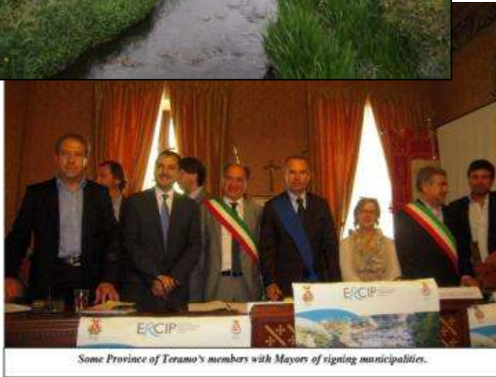
Some Province of Teramo's members with Mayors of signing municipalities.